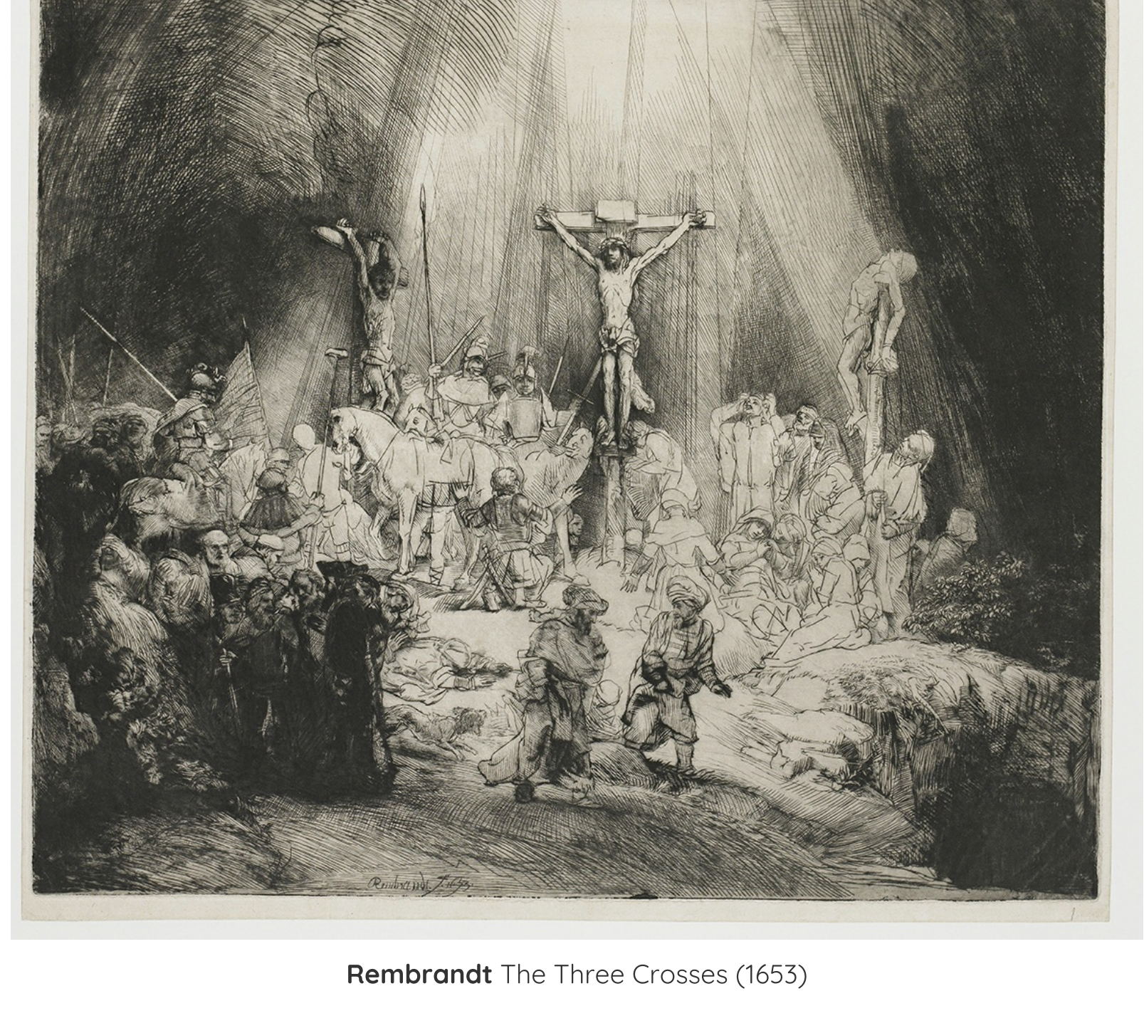
Rembrandt The Three Crosses (1653)

For more information and other concerts see our Calendar .